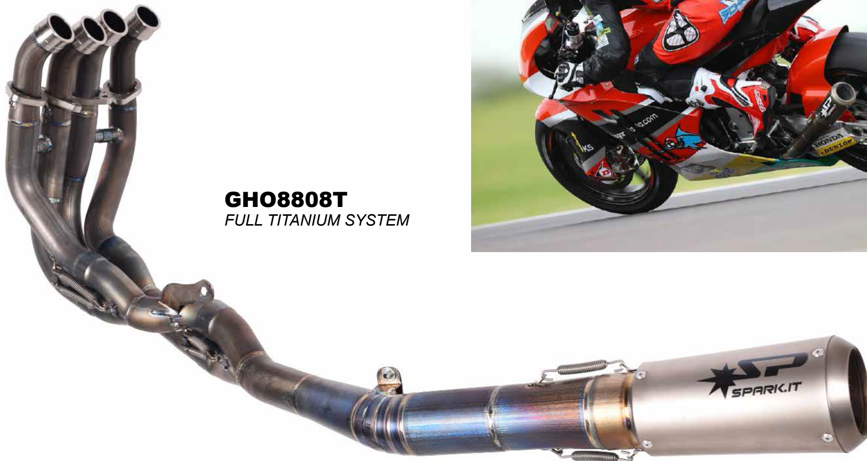
GHO8808T FULL TITANIUM SYSTEM